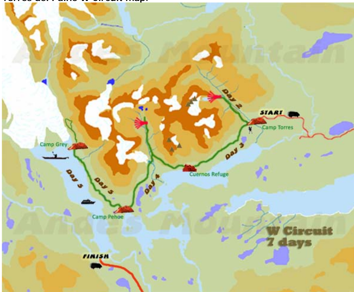
Torres del Paine W Circuit map.