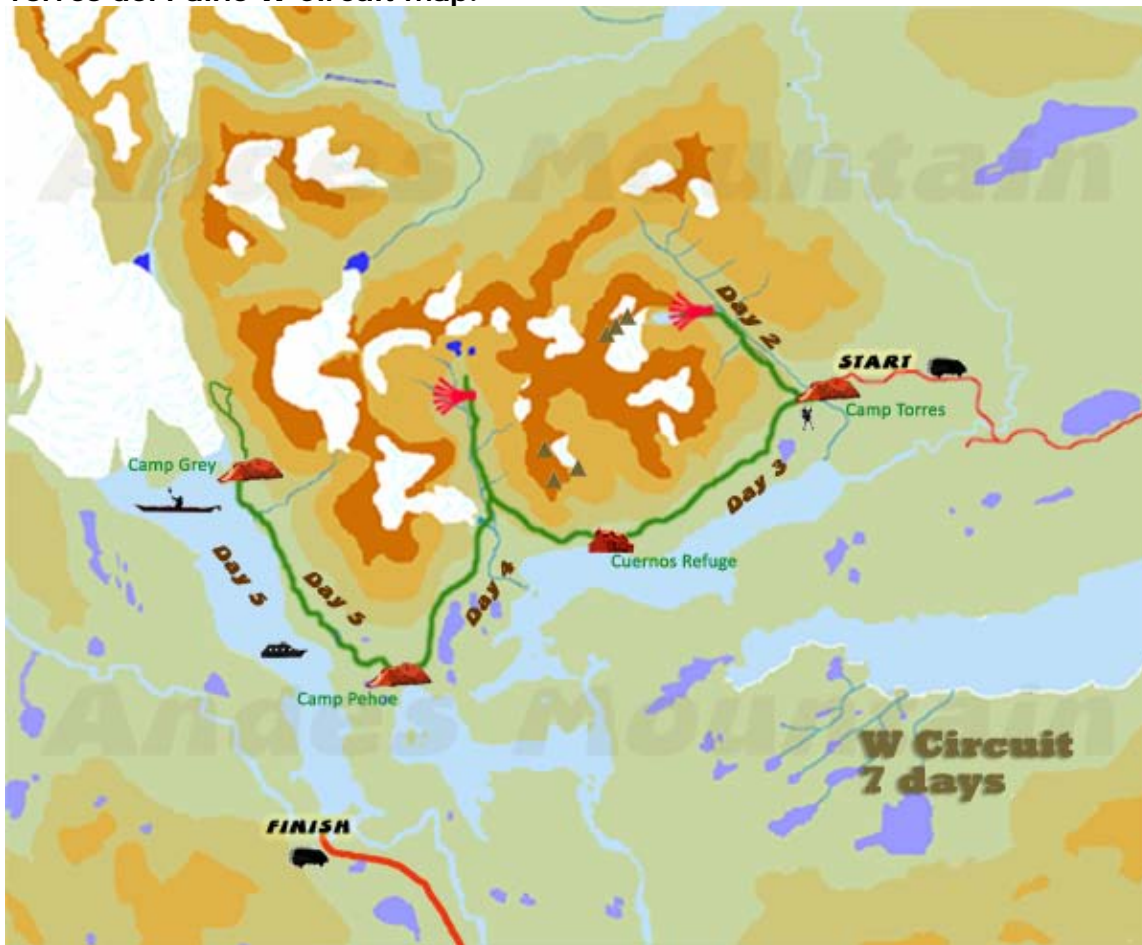
Torres del Paine W Circuit map.